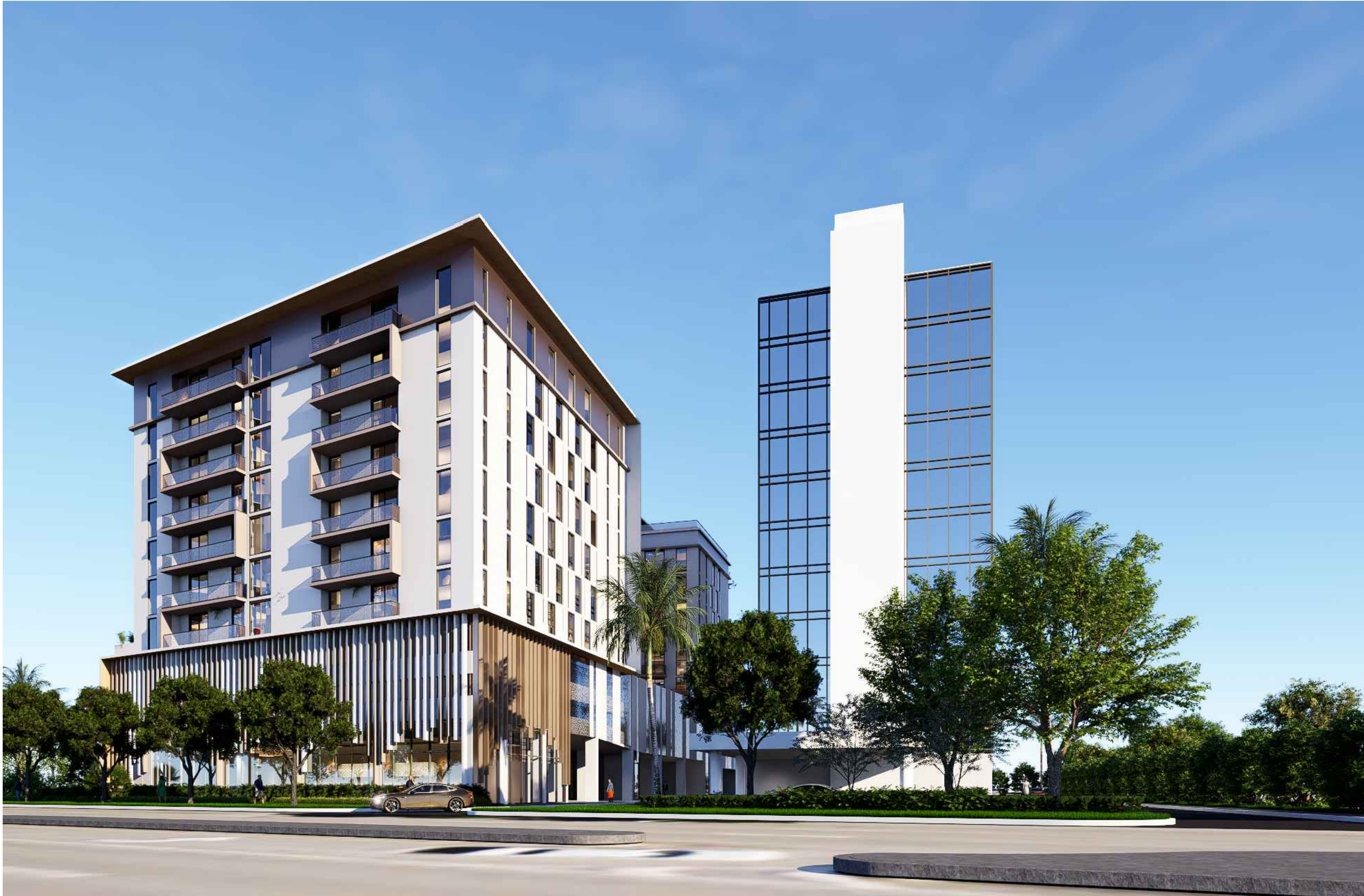
STREET VIEW OF THE SOUTH WEST CORNER OF THE BUILDING